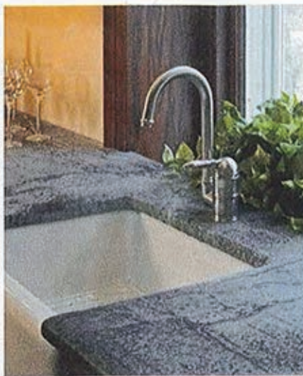
ADD A SECOND SINK The butler's pantry features a Kohler farmhouse sink (kohler.com) and a Rohl faucet set in the same Brazilian soapstone countertop as in the rest of the kitchen.