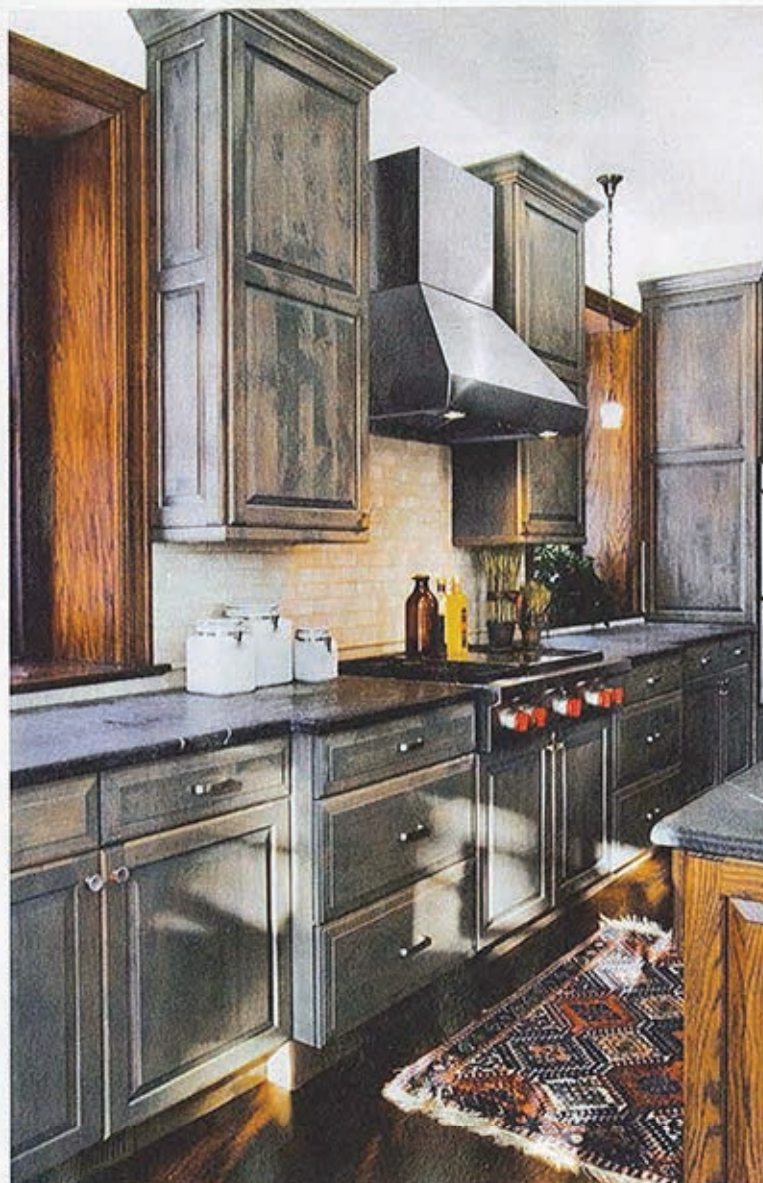
BUILD IN CONTRASTS To prevent the galley from appearing dark, the couple mixed driftwood-stained alder and oak cabinets (Adelphi Kitchens & Cabinetry; adelphikitchens.com) with help from Adelphi's design specialist Nadia Waltz, C.I.D.

The old house needed an updated kitchen in tune with its historic roots.